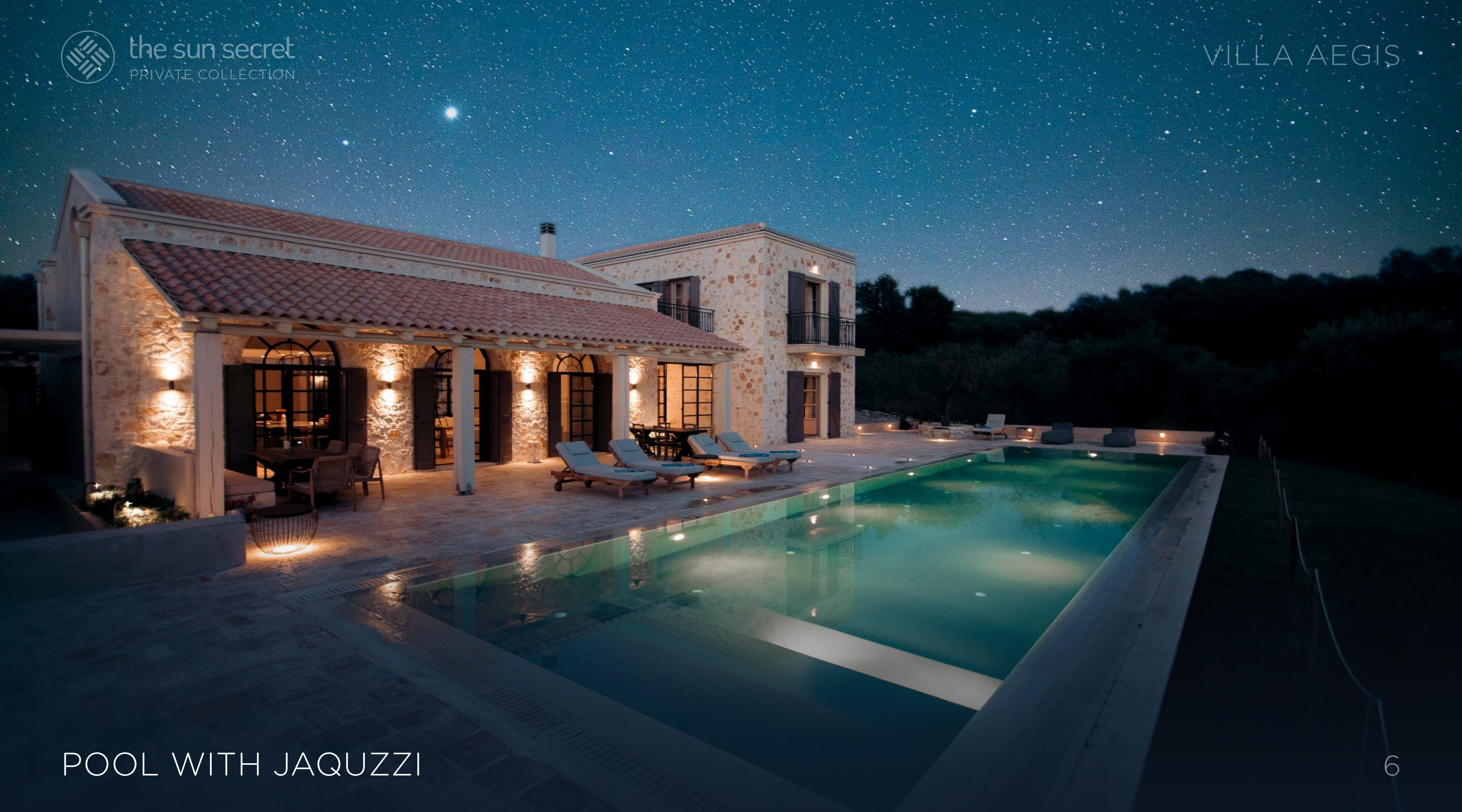
POOL WITH JAQUZZI